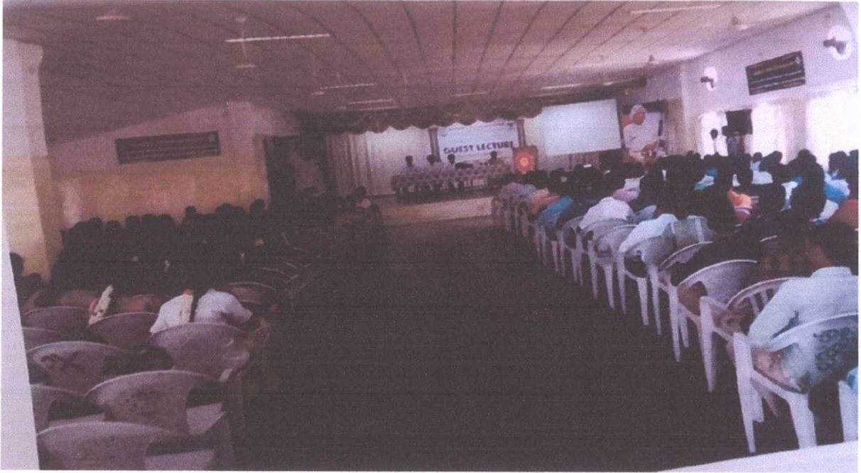
Awareness programme on Higher studies

Accredited by NAAC with 'A' Grade & Recognized u/s 2(f) and 12(B) of the UGC Act 1956 Kalippatti – 637 501, Namakkal (Dt), Tamil Nadu.